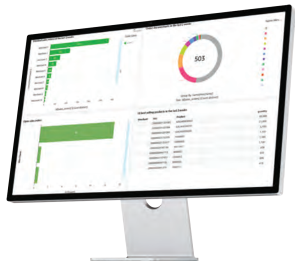
PULPO 3PL warehouse management dashboard

Imagine a world where you have all your customers and their integrations under one roof. With PULPO's 3PL feature, you can effortlessly scale operations, streamline warehousing, and enhance overall efficiency. Say goodbye to the chaos of multiple systems and hello to clear inventory visibility, swift onboarding, and error-free processes. PULPO is your ticket to more organized, efficient, and profitable warehouse operations.